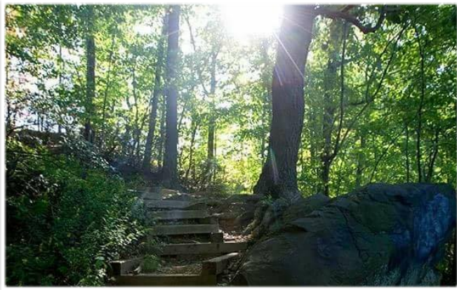
Crum Woods, Swarthmore College